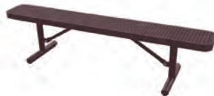
6' Champion Bench 935-301, 302, 304, 307 All Mounts*