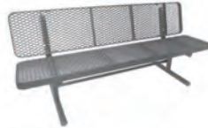
6' Champion Supreme Bench 936-301, 302, 307 All Mounts* 4' Supreme not pictured