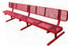
10' Champion Bench 934-601, 602, 607 All Mounts*