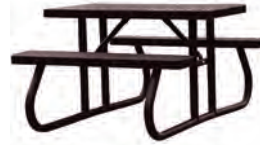
4' Champion Table 924-101 Free Standing 69"x48" Footprint