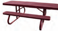
8' Champion Accessible Table 950-501 Free Standing 60"x96" Footprint