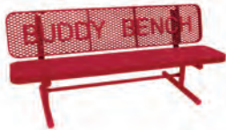
6' Buddy Bench 936-3B1, 3B2, 3B7 All Mounts* 8' Buddy Bench not pictured