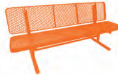
8' Champion Supreme Bench 936-501, 502, 507 All Mounts* 10' Supreme not pictured