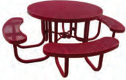
4' Champion Round Table 955-101 Free Standing 77" Diameter Footprint

Need Quick Delivery? These 100% PVC-coated, steel products are available in expanded metal and will ship in TEN BUSINESS DAYS OR LESS , if ordered in Blue, Hunter Green, Brown, or Black . Products ordered in Red, Burgundy, Yellow, Orange, Ivory, Evergreen, Gray, and Purple will ship in FIFTEEN BUSINESS DAYS OR LESS!