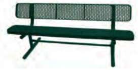
6' Champion Bench 934-301, 302, 307 All Mounts* 4' not pictured