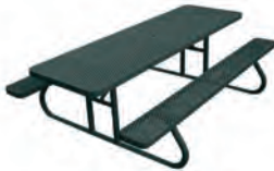
8' Champion Table 924-501 Free Standing 69"x96" Footprint