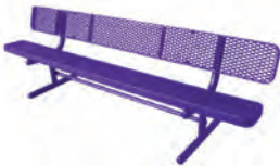
8' Champion Bench 934-501, 502, 507 All Mounts*