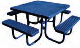
4' Champion Square Table 926-101 Free Standing 76"x76" Footprint