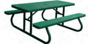
6' Champion Table 924-301 Free Standing 69"x72" Footprint